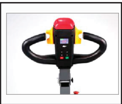
RUYI Handle with PIN Code