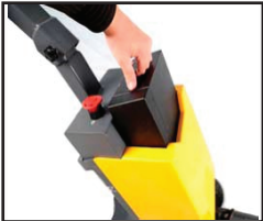
24V/30AH Lithium Battery